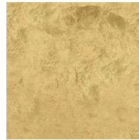
Gold Leaf - GLF